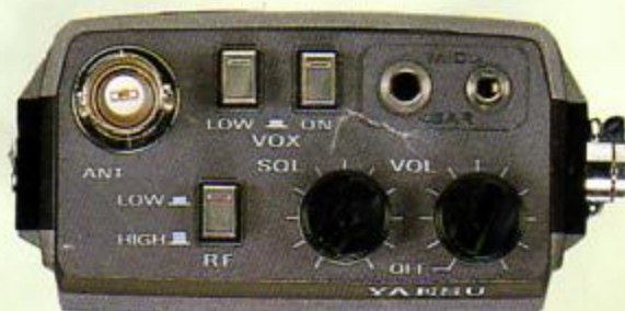
All above photos are actual size.

High/low power, and VOX on/off and level switches are located on the top panel, along with BNC-type antenna jack.